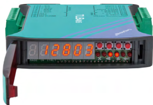
SPACE SAVING COMPACT DESIGN